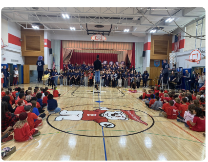
Kicking off our Brasser Way assembly with a special visit.